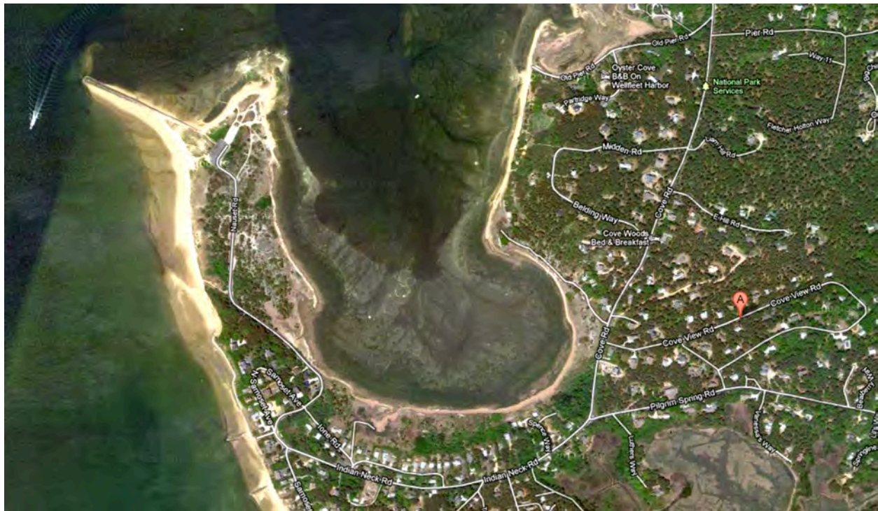
Cove View Road is marked with "A." Several beaches in walking distance on left.