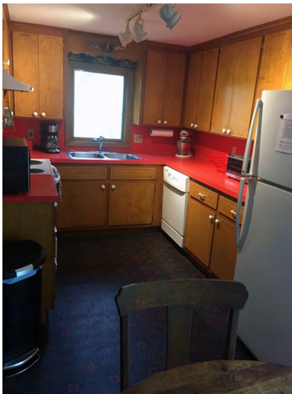
Fully equipped kitchen with dining area, and second set of sliding doors onto deck. Left: kitchen and dining area from living room. Right: Kitchen.