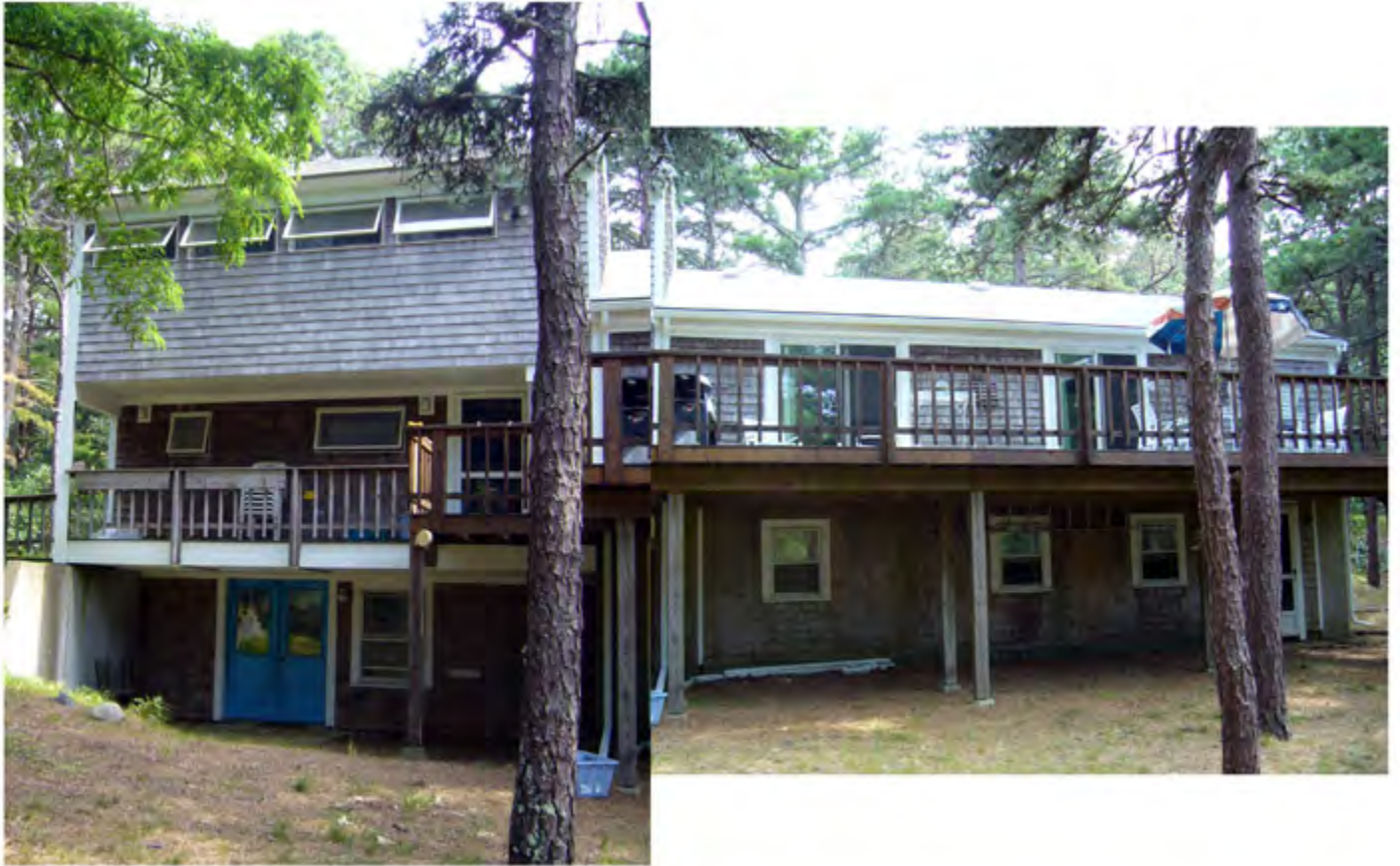
Views of back of the house.

Kitchen: Full size refrigerator, stove, microwave, dishwasher, coffee pot. Fully equipped with pots and pans, dishes, serving dishes and utensils, Eating area with large table and chairs that can accommodate 8. Additional refrigerator in the basement.