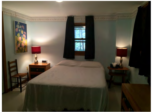
Views of the two lower level bedrooms (above and below)