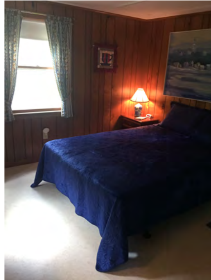
First floor bedroom (above)