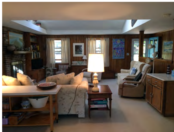
Left: From front of house facing deck. Right: From door to deck looking toward the front of the house. The house is filled with beautiful Cape-themed art.