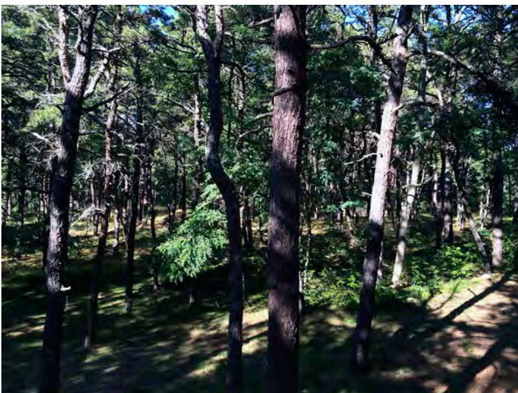
Setting: The house is situated on a double lot featuring plenty of privacy around the house and between neighboring houses.